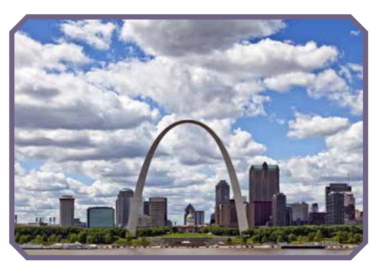
The Midwest Region meeting was held in St. Louis, Missouri

Attendees agreed that this session at all the pilot meetings encourages students to consider the economic activity underlying accounting information, the gray areas that can occur in arriving at the accounting figures, and the business