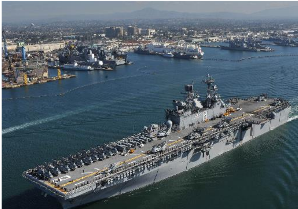
San Diego, CA (August 5-9, 2017)

Looking ahead , following the 2016 meeting in New York, the next two AAA Annual Meetings will be held in: