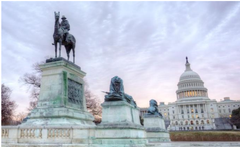
National Harbor, MD-Washington, DC (August 4-8, 2018)