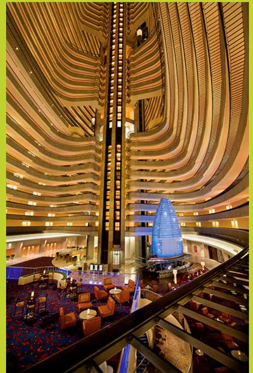
Atlanta Marriott Marquis

Meeting Registration desk at the Marriott Marquis, even if your first event is scheduled at the Hilton.