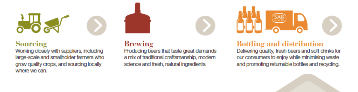
Figure 5. SABMiller's Sustainable Value Chain.

We create sustainable value chains that contribute to local economic and social development.