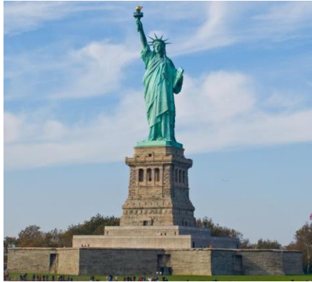
New York, NY (August 6-10, 2016)

Future AAA Annual Meetings will be held in: