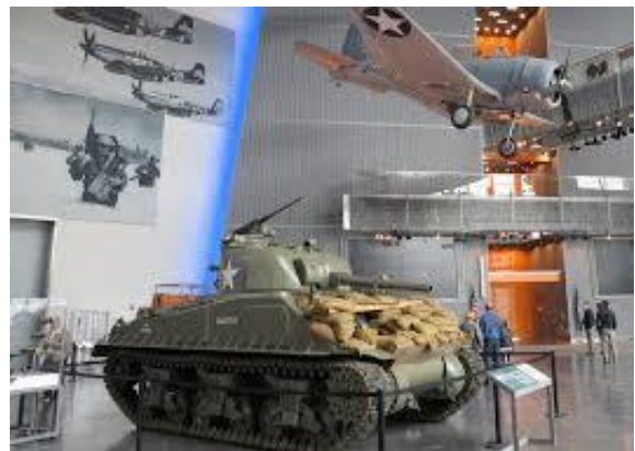
National World War 2 Museum

The Allied Academies will hold its Spring 2015 meeting in New Orleans, on Wednesday, April 8 through Friday, April 10, 2015. The deadline for all submissions and registration is Wednesday, February 26. The registration fee for submissions received on or before that date is $325. The registration fee for any submissions received after the deadline is $375. Please note that each conference participant who plans to attend the conference must register, and at least one author on every paper is required to register.