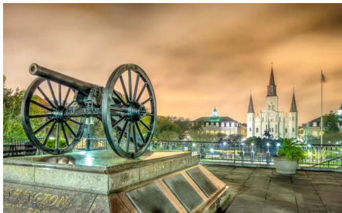
Looking toward Jackson Square

Call for Papers: The Allied Academies, International Conference in New Orleans, April 8-10, 2105: