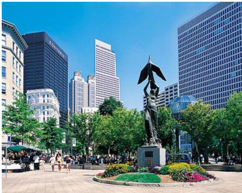
Atlanta: a phoenix rising from the ashes (after Sherman's march)