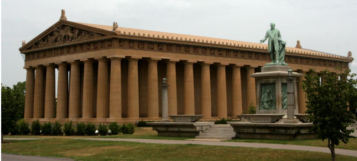
Parthenon full-size replica in Nashville, TN

To provide you with maximum outlets for your research, the Allied Academies will hold joint meetings of all its member academies. Each Academy publishes one or more double blind, peer reviewed journal, with a 25% acceptance rate. To provide you with maximum outlets for your research, the Allied Academies will hold joint meetings of all its member academies: