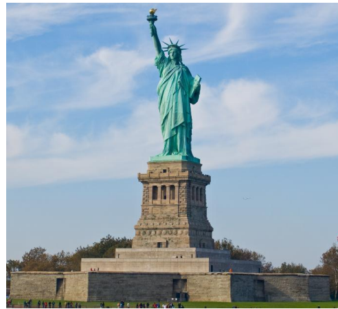
New York, NY (August 6-10, 2016)