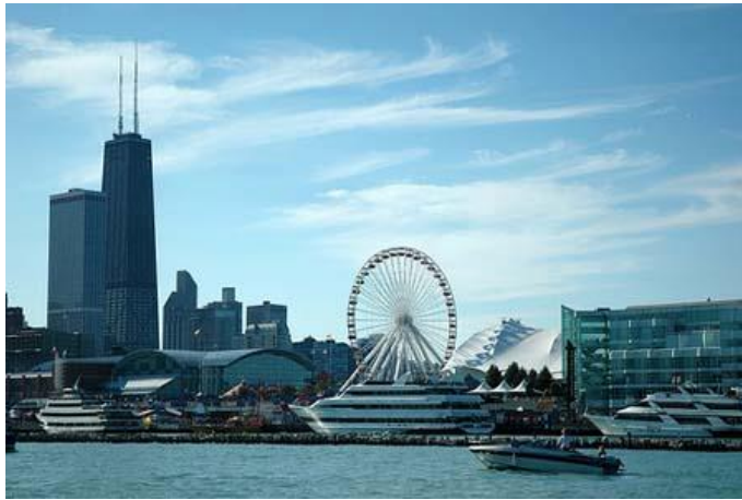
Chicago, IL (August 8-12, 2015)