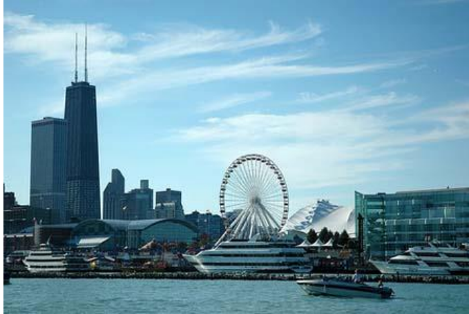
Chicago, IL (August 8-12, 2015)

Future AAA Annual Meetings will be held in: