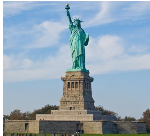
New York, NY (August 6-10, 2016)

Atlanta, Georgia, August 3, 2014-August 3, 2014