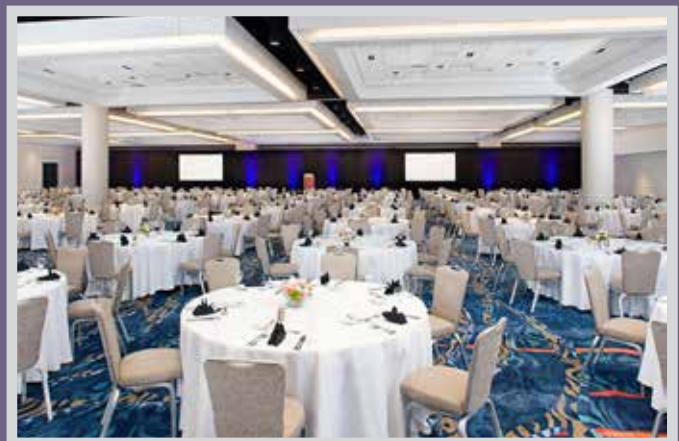
A MEETING ROOM SET UP FOR A LECTURE (TOP) AND THE GRAND HALL SET FOR A BANQUET AT THE MANCHESTER GRAND HYATT SAN DIEGO