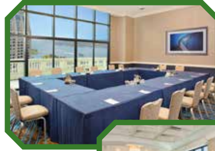
MEETING/ EVENT OPTIONS AT THE MANCHESTER GRAND HYATT SAN DIEGO