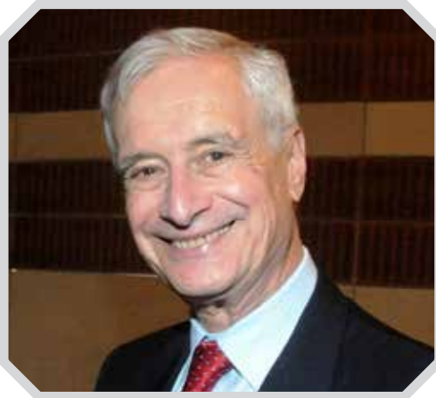
ROBERT S. KAPLAN