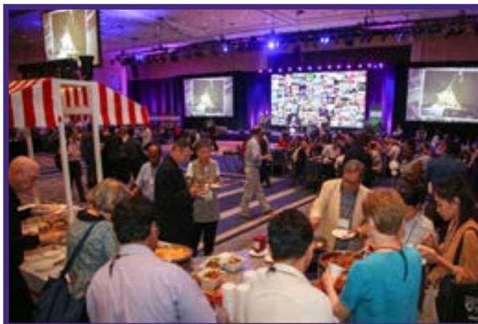
Members enjoyed the Monday evening Welcome Reception at last year's Annual Meeting in Washington, DC