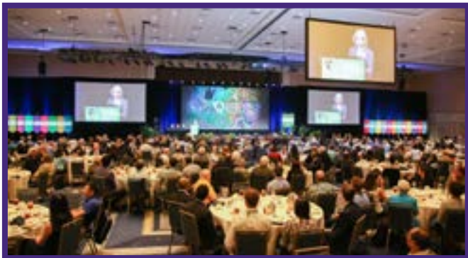
Members attended the Wednesday AAA Luncheon at last year's Annual Meeting in Washington, DC