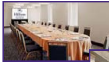
Meeting/Event spaces at the Hilton San Francisco Union Square

We will need to know the period during which you wish to hold your meeting/function (date, time, and length); the name of the event; estimated attendance; and the names, telephone number, and email address of the contact person. The AAA will schedule a meeting room based on availability by June 2019. Events with food and beverage will be coordinated directly with the Hotel Catering Department where the event is scheduled for menu selection and payment.