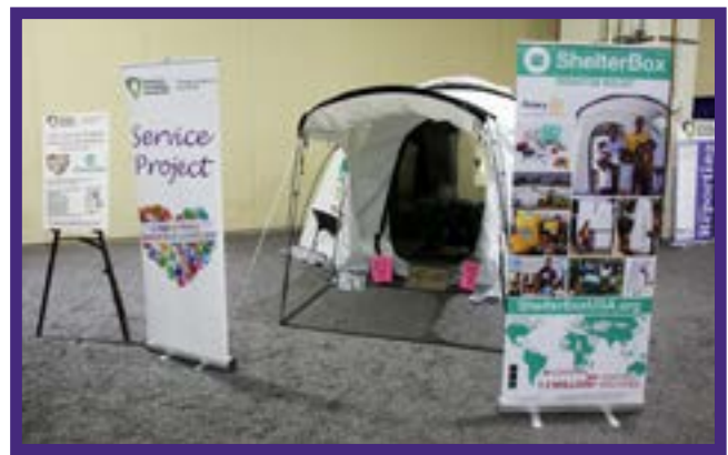
A ShelterBox tent and supplies were on display in the Exhibit Hall in the Gaylord National Resort and Convention Center in Washington, DC.