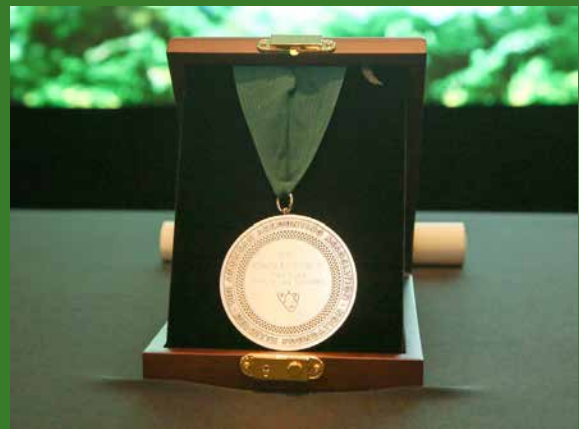
The American Accounting Association/J. Michael and Mary Anne Cook/Deloitte Foundation Prize Medal