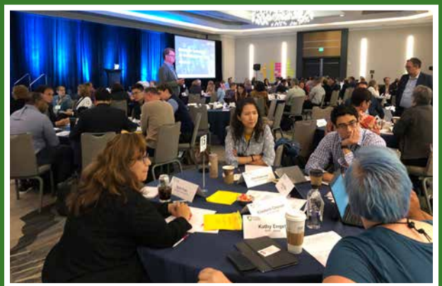
Participants of the 2018 Blockchain Technology Conference discuss ideas at the workshop.