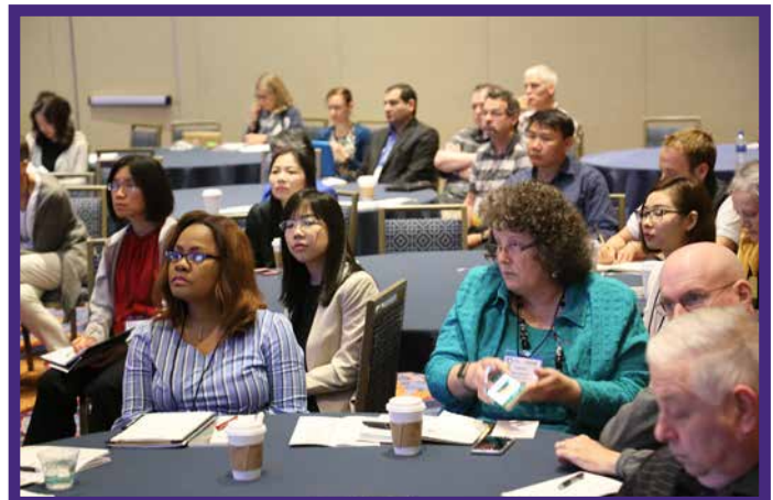
Participants engage in sessions at the 2018 Conference on Teaching and Learning in Accounting (CTLA)