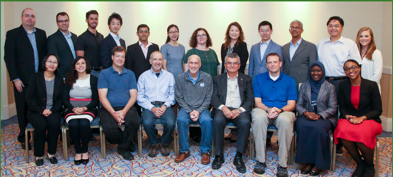
Participants of the 2018 Global Emerging Scholars Research Workshop in Washington, DC.

We look forward to hosting the 2019 Global Emerging Scholars Research Workshop at the next Annual Meeting in San Francisco, CA!