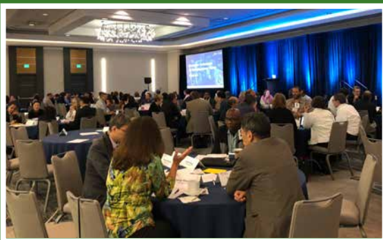
The 2018 Blockchain Technology Conference