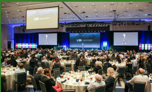
Wednesday AAA Luncheon