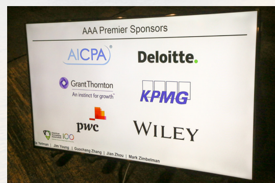
Example of where logos are displayed.