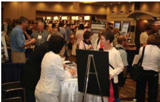
2008 Annual Meeting Career Fair