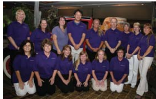
AAA Staff at the 2008 Annual Meeting