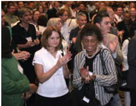
Members leaving the last 2008 Annual Meeting concurrent session on Wednesday for the afternoon drawing

If you are interested in sponsoring your students' membership, please go to http://aaahq.org/membership/SponsorStudents.pdf to download a copy of the enrollment form.