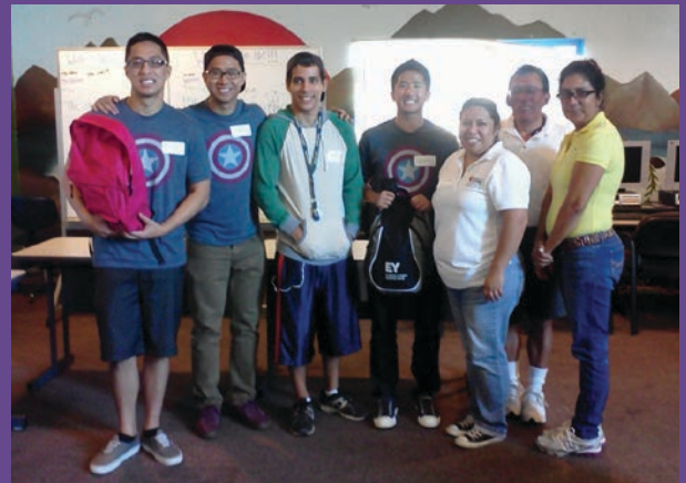
At the Annual Meeting, again this year, our Service Project was a great success! Thank

you to EY and our members for joining in our Service Project and donating over 500 backpacks full of school supplies to the Community Action Partnership of Orange County (CAPOC).