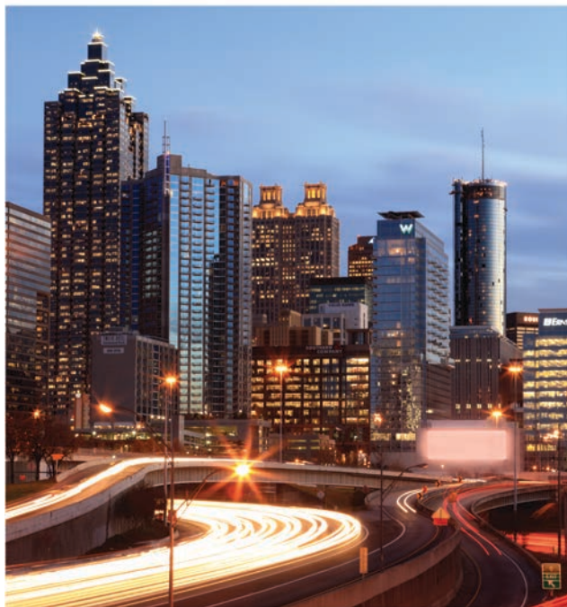
American Accounting Association Annual Meeting — August 2–6, 2014 and Conference on Teaching and Learning in Accounting