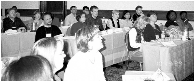
Participants attending one of the sessions at the second annual Auditing Doctoral Consortium.