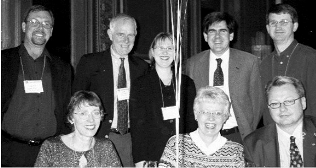
Some Midyear Meeting attendees from 'down under,' 'up over' and in between.