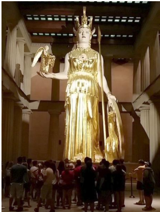
Statue of Athena in Nashville’s full-size replica of the Greek Parthenon.

All-Day Café in the lounge lobby or take in the best views in Nashville from Tall Tales, the rooftop cocktail bar. With soaring ceilings, private nooks, comfy rooms, and an artist-driven ambiance, Waymore’s curates the true Nashville experience.