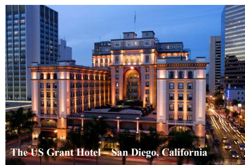
The US Grant Hotel - San Diego, California